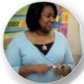
EDUCATION AND CHILDCARE