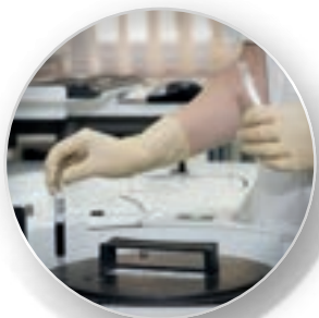
HEALTH AND SCIENCE