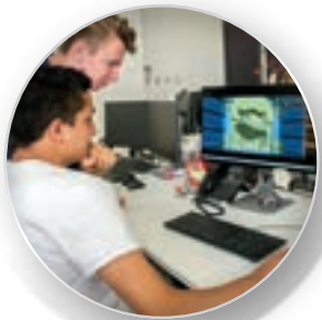
CREATIVE AND DESIGN