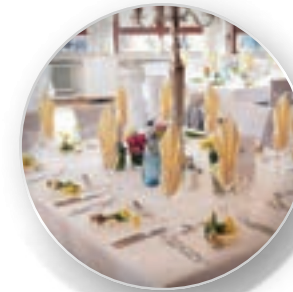
CATERING AND HOSPITALITY