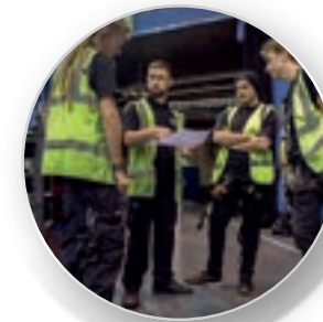
ENGINEERING AND MANUFACTURING