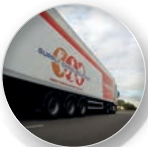
TRANSPORT AND LOGISTICS