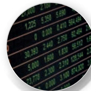
SALES MARKETING AND PROCUREMENT