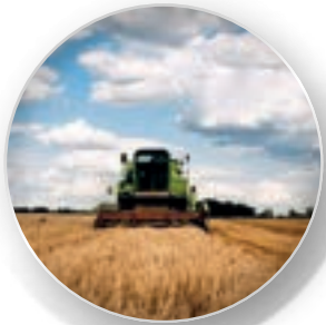
AGRICULTURE, ENVIRONMENTAL AND ANIMAL CARE