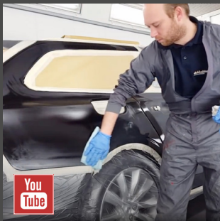
PAINTING A CAR WITH STANDOX DUTCH CAR PAINTER

Have a look at these YouTube videos that will give you a taste of what is involved in preparation, application and finishing, to achieve a perfect paint job.