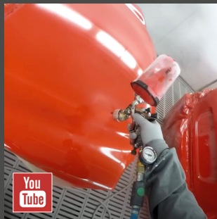
FULL EXTERIOR RESPRAY THE GUNMAN