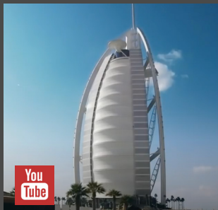
THE BILLION POUND HOTEL