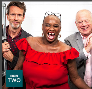
GREAT BRITISH MENU