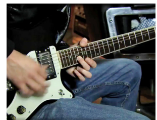
THE SOUNDS OF BRITAIN

Use these websites to help you with the tasks below and develop your understanding: