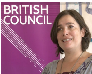
LEARNING ENGLISH TOGETHER